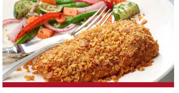
Air Fryer Buttermilk Fried Chicken diabetesfoodhub.org/recipes/ air-fryer-buttermilk-fried-chicken